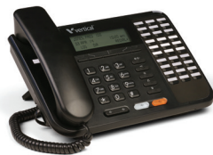
Edge 9000 Series Digital Phones

Get the most out of the Summit's feature set with Vertical's new Edge 9000 Series IP and digital phones and DECT phones featuring display-based interfaces, call logs, self-labeling keys and simplified administration. The Summit also integrates with other SBX IP and MBX IP digital, SIP and IP phones, as well as Vodavi single-line analog, XTS, STS and Triad phones to protect and extend your current communications capabilities and investment.