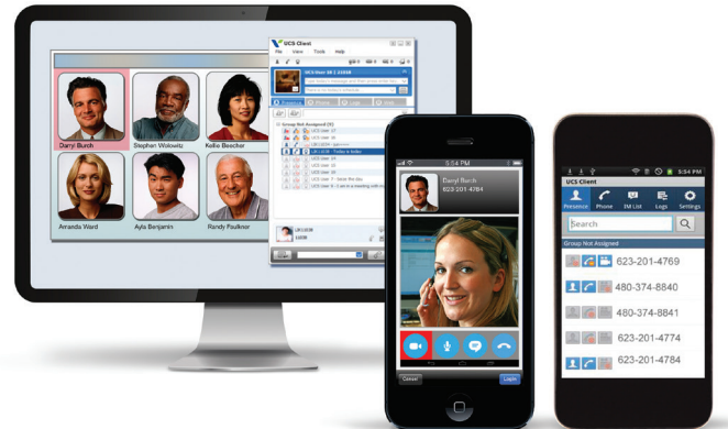
Summit UCS Desktop & Mobile Clients