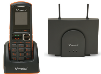
Summit Wireless DECT System

The Summit is also compatible with Vertical's SBX IP and MBX IP platforms, so you can quickly network up to 250 sites together while creating a simple migration path to the full-feature and cost-saving benefits of the Summit's built-in VoIP technology.