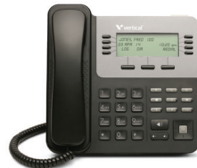
Edge 9000 Series IP Phones